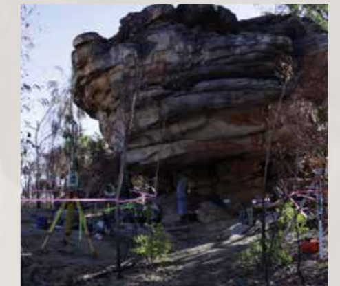
Archaeological dig site, Drysdale Nationa Park, Kimberley Visions Project.

The Minderoo Foundation has pledged a further $500k for an Associated Research Fund and KFA has pledged to match it. All up we need to raise $1Million. This Chair will help establish the importance of Australia's archaeological record in the global narrative of human origins and migrations and build momentum towards bringing the deep history of Australia's indigenous past to life.